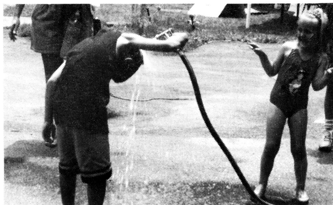
3. Get wet!