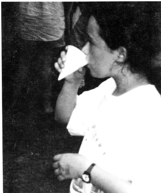
2. Drink a lot of water!