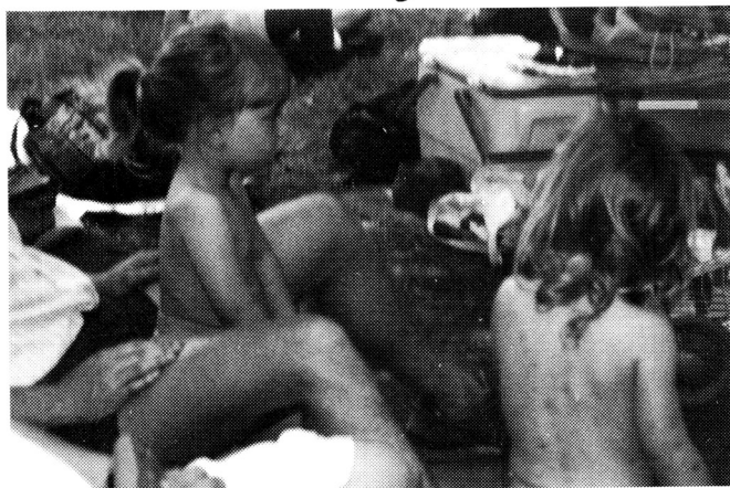
10. Dress COOL -ly! But whatever you do, have a great time!

Photos taken at The Clearwater's Great Hudson River Revival '94. Thanks to the Clearwater staff for their support and assistance.