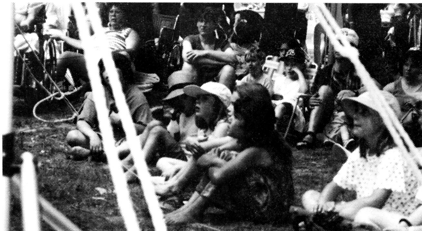
1. Forget the heat by getting into the music!