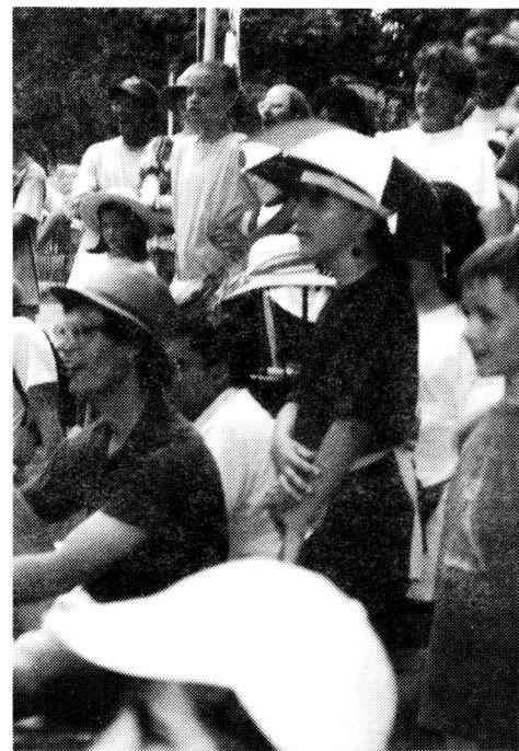
5. Wear a HAT to make some shade for yourself!