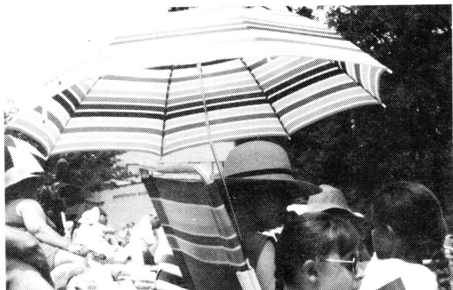
6. Bring an umbrella and make some shade for your friends!