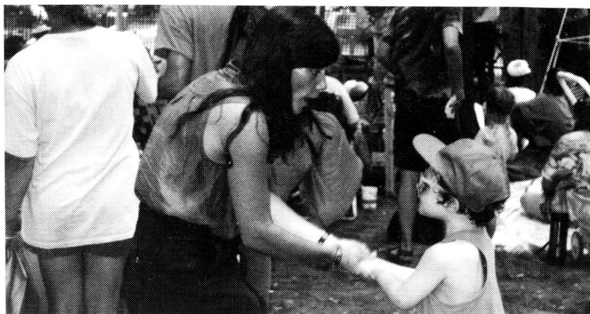
8. Or swing your partner!