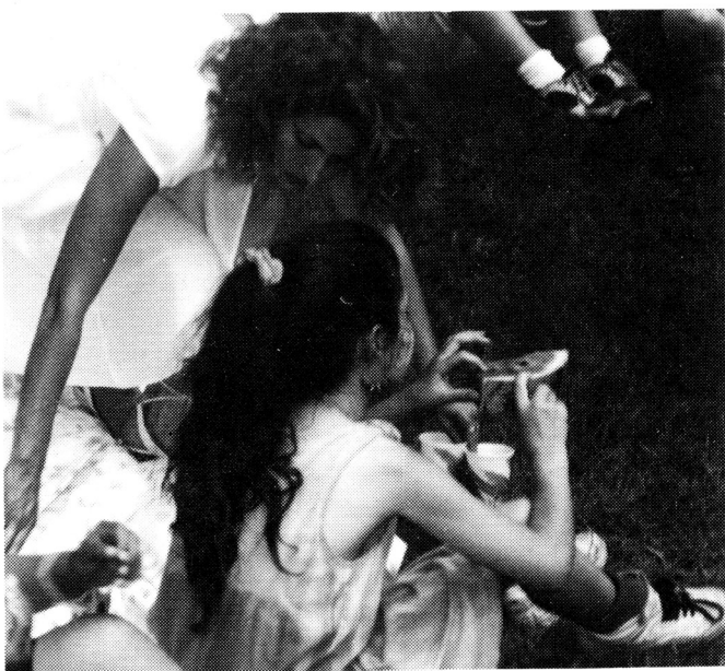
9. Eat COOL foods!